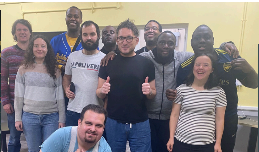
Bringing autistic voices and families together