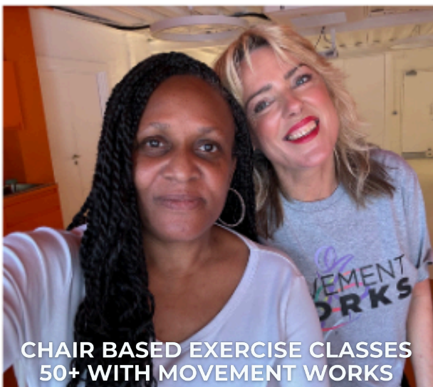
CHAIR BASED EXERCISE CLASSES 50+ WITH MOVEMENT WORKS