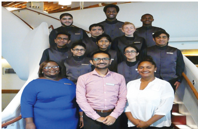
The DFN Project SEARCH Interns and their supporting managers at the Hilton London Heathrow Airport Terminal 5 hotel, 2019

www.barnetlocaloffer.org.uk/pages/home/information-and-advice/preparing-for-adulthood/education-training-and-employment/supported-internships