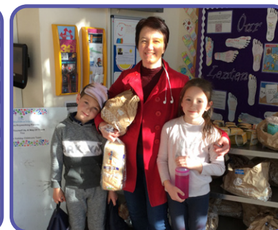
Food hampers provided by The Felix Project