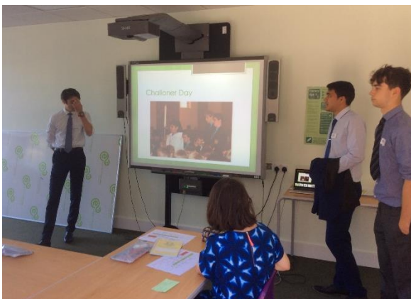
Sixth Form prefects delivering a presentation to PEP students

Students enjoy a slightly shortened day (later start and earlier finish) than the rest of our school community. This enables students to avoid arriving and leaving the school at the busiest times of the day. Their timetable follows the same structure as the main school timetable and again, this enables students to integrate at break and lunchtimes in supervised areas or make use of Sixth Form facilities.