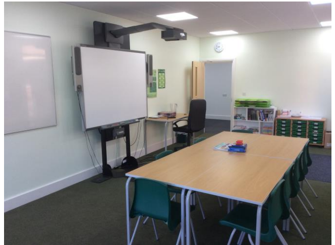
Small, well-equipped classrooms form the main teaching areas of the provision

The St. Francis Xavier Centre enjoys its own, purpose built classrooms and social spaces in close proximity to our Learning Support Department. We want to make students feel comfortable as they learn, socialise and relax and we hope our current plans help to achieve a balance between all of these conditions. We hope to complete Phase 2 of our building work before next academic year – this will involve expanding our social area to include a fully functional kitchen space. Each classroom is fitted with SmartBoard technology; indeed ICT plays a crucial role in the way that students are encouraged to learn and communicate. Each student will make use of iPads extensively as a learning tool and organisational device; additionally students will have access to Wi-Fi for any other personal or learning devices.