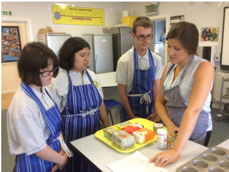
Students making cakes engaged in our Food Skills programme

In addition, our Phase 2 plans feature an outdoor learning space and a social area which are exclusively for centre use. We hope this will allow students to make choices about how and where they spend their time during unstructured times of the day. The close proximity of the centre to our existing Learning Support Department means that strong links are also forged with our flagship SEND provision. As members of Richard Challoner Sixth Form, all students will also have access to the Mezzanine (Café) and exclusive Sixth Form spaces. Other subject areas such as Food Skills and Drama will be taught in modern, well-equipped classrooms. Students can also make full use of our residential space at the front of our school building which can be used to teach a range of independent living skills.