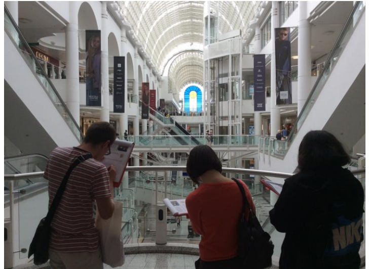
Students on a visit to Kingston Town Centre as part of their Life Skills programme

Students make use of a planner to assist them with organisation tasks; indeed students are also expected to complete short tasks outside of class time as would be expected in college. Students wear a uniform which is unique to the provision and comfortable/practical for a variety of tasks; however, students also enjoy wearing casual clothing on selected timetabled days. Travel training forms an important part of our timetable and students benefit from a bespoke, practical travel training session. Evening events and socials also allow students to practice travelling to a planned location within a real-life context.