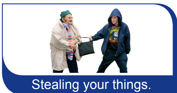
Stealing your things.