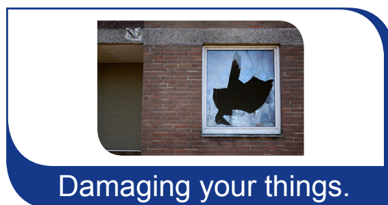
Damaging your things.