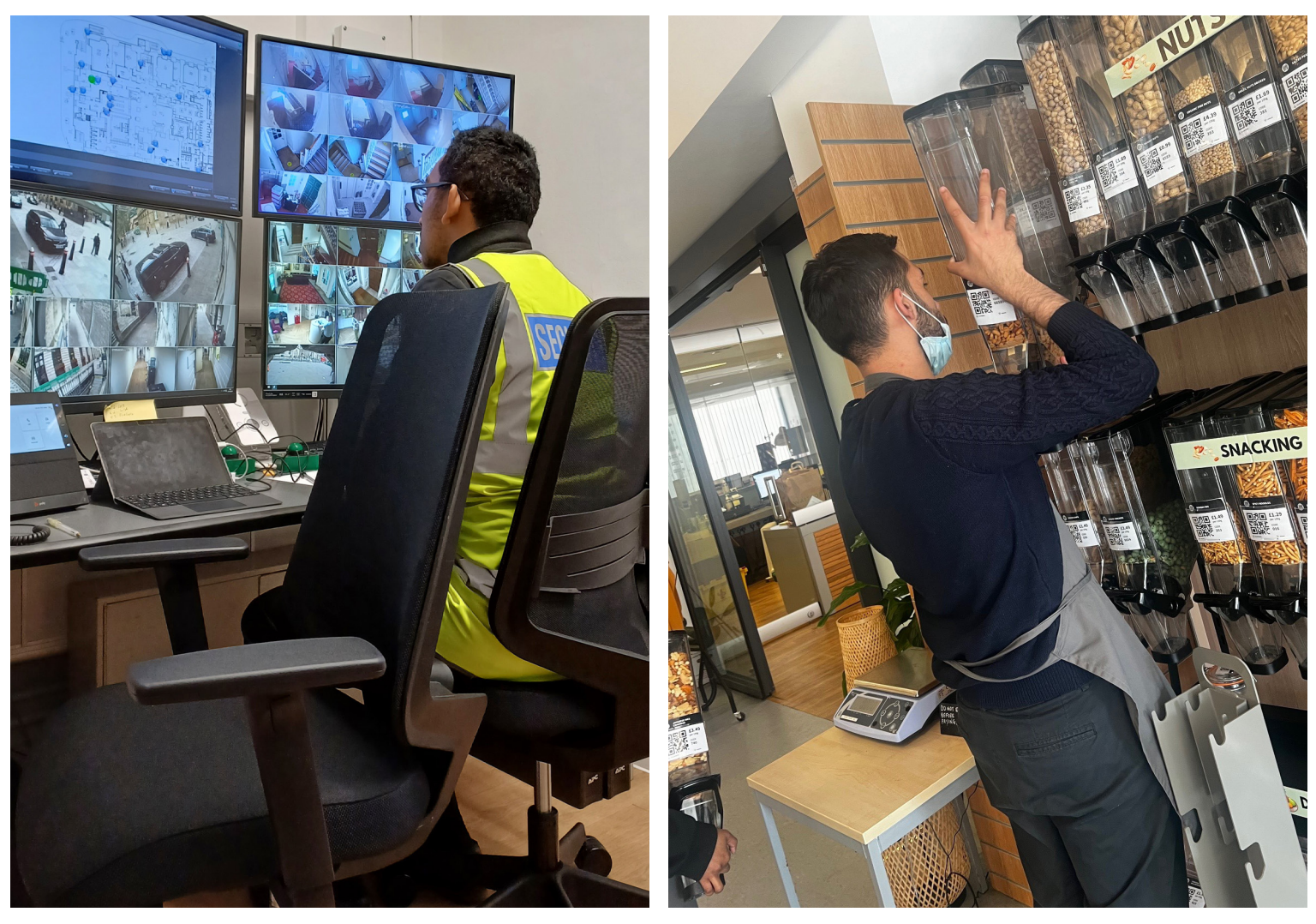
Young people at their internships