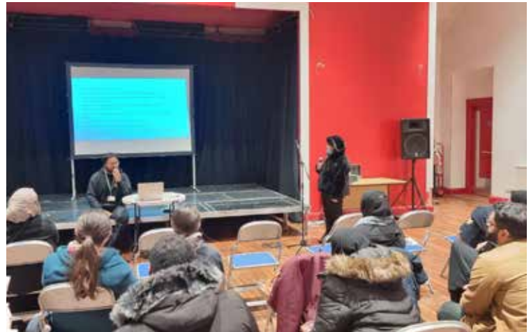
Our Time All Ability Youth Forum