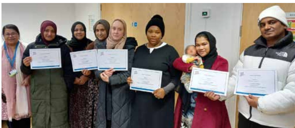
Parents receiving their certificates on completion of the Triple P parenting programme

The parents valued the opportunity to share their experiences with each other and receive support from the