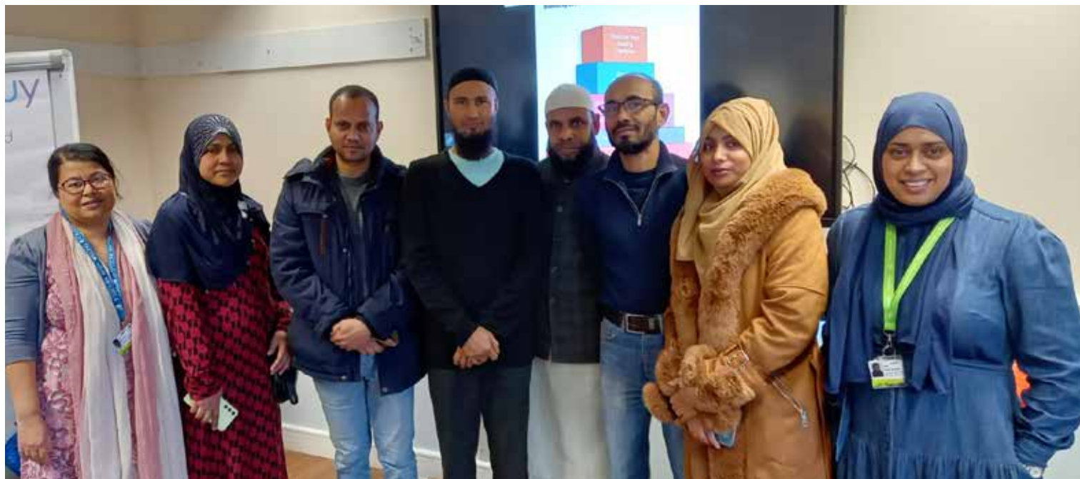
Parents from the SFSC parenting course at the Parent Advice Centre