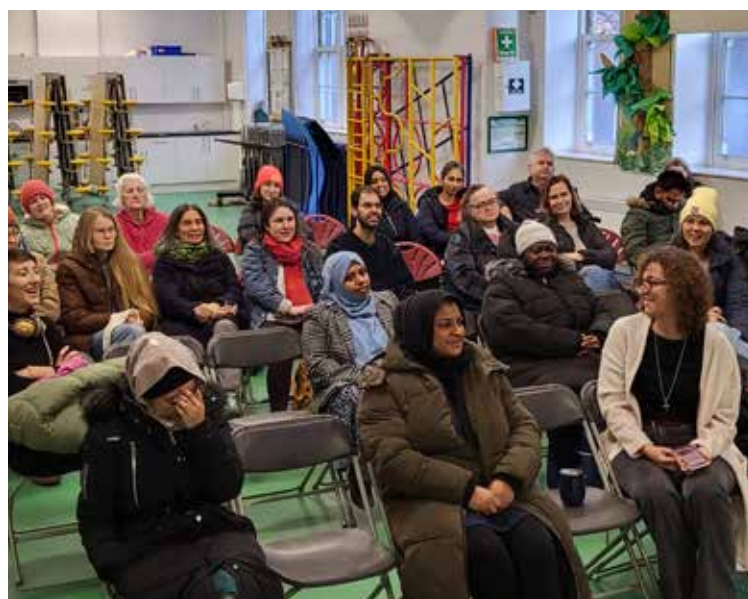
Parents at the Keeping Children Safe Online session at Globe Primary School

The session at Globe Primary School provided a safe space for parents to share their concerns and insights regarding their children's online activities. Parents from the school really valued the opportunity to talk about the challenges they face – from managing screen time to addressing cyberbullying incidents.