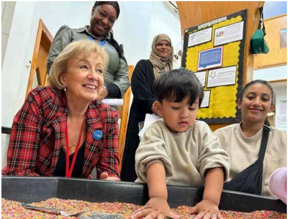
Dame Andrea Leadsom (front left) visiting the John Smith Family Hub

Under the new Family Hub model, local services work together to provide joined-up support. This ensures that children, young people and families get the right help at the right time.