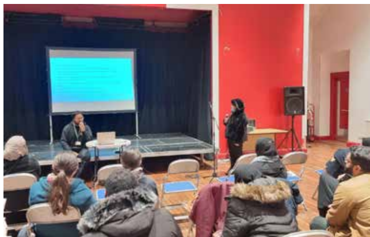
Our Time All Ability Youth Forum