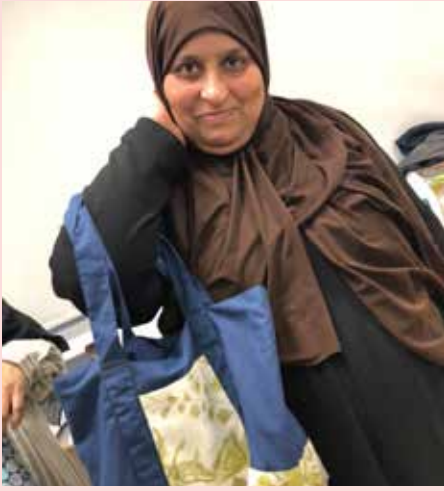
Parent from the sewing course with the tote bag she made