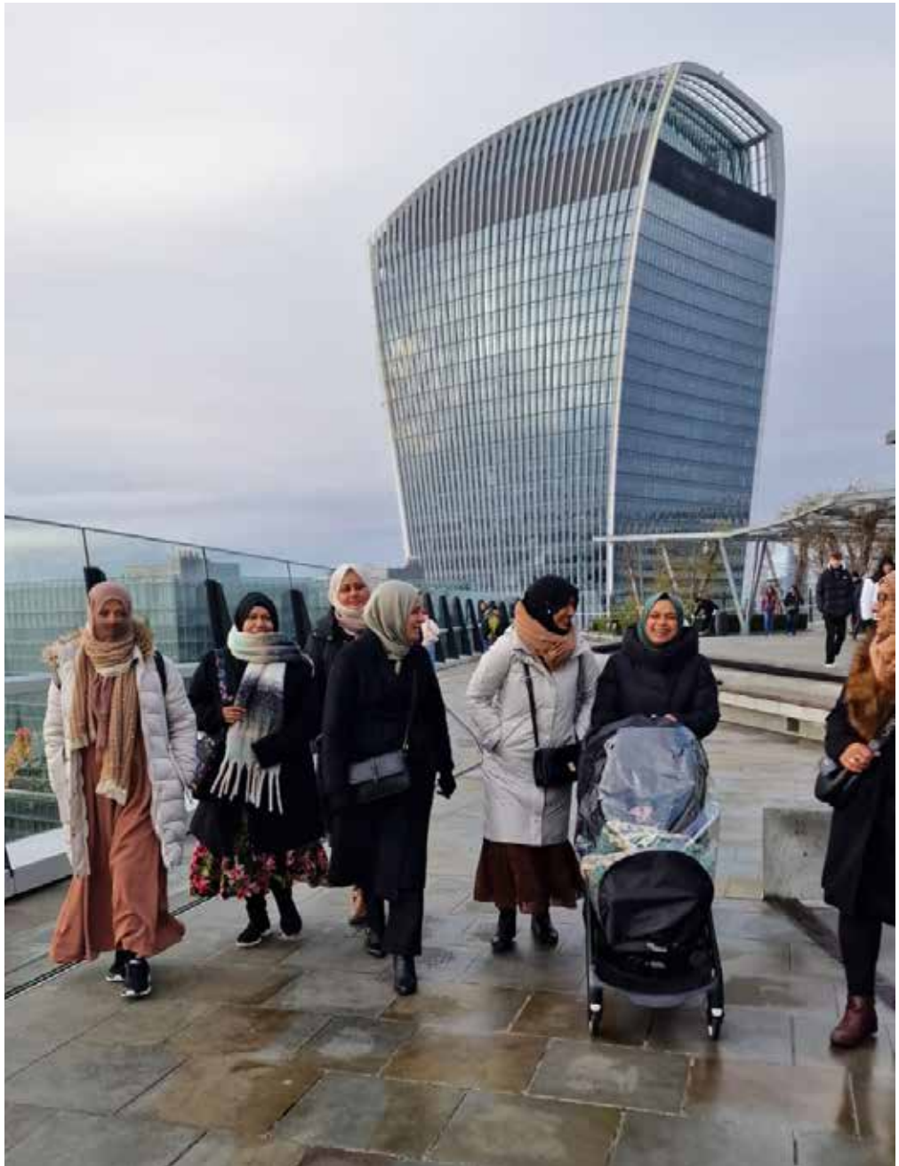
Parents from Bow Secondary School enjoying the city skyline views at The Garden at 120 in Fenchurch Street