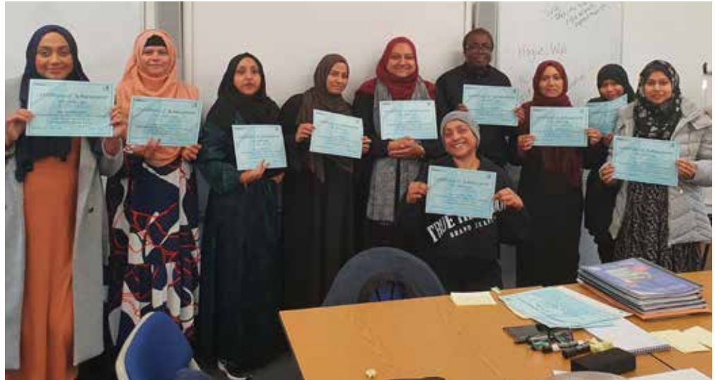
The latest cohort of E1 Partnership parent volunteers receiving their certificates

The E1 Partnership has been helping the latest cohort of parents prepare for their volunteer role by offering selected parents a place on the 'Volunteering in Your Child's School' course, which was