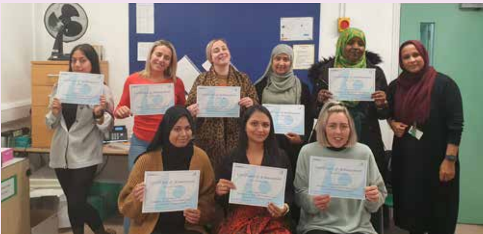
Columbia Primary School parent volunteers receiving their certificates

Columbia Primary School has been successfully running the 'Volunteering in Your Child's School' since 2016. It has been supporting potential parent volunteers by offering them a place on the five-week introductory course. The course