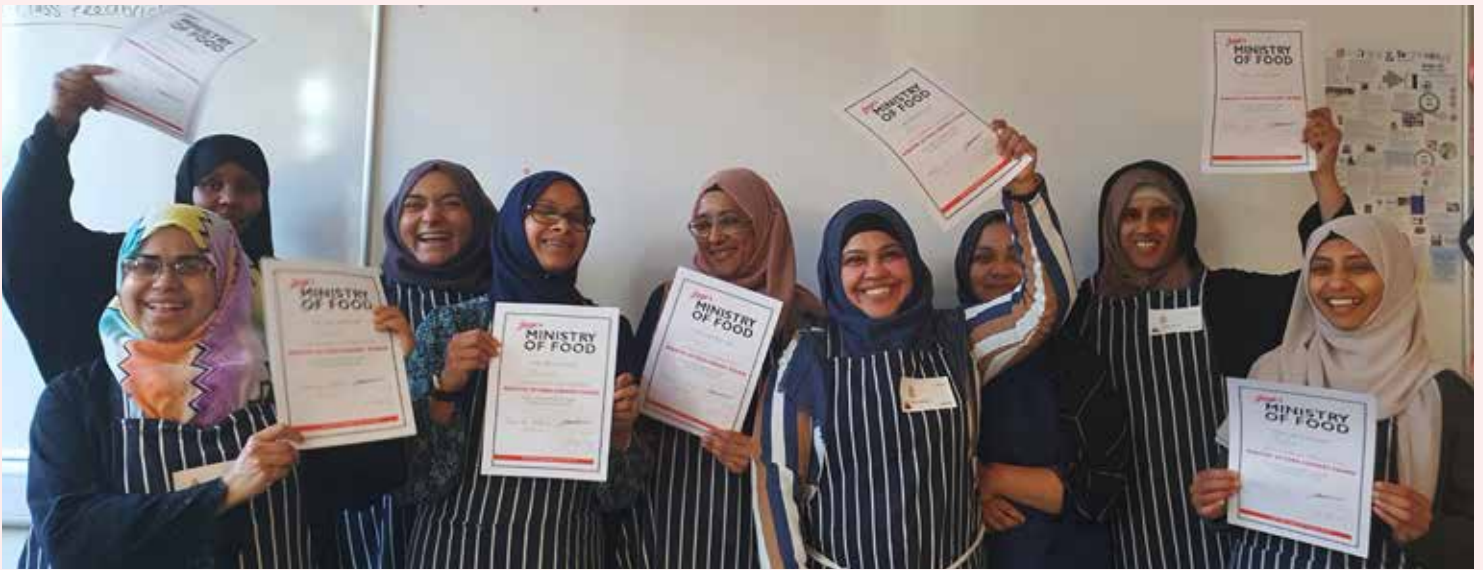
Parents from Central Foundation Girls' School receiving their Ministry of Food certificates