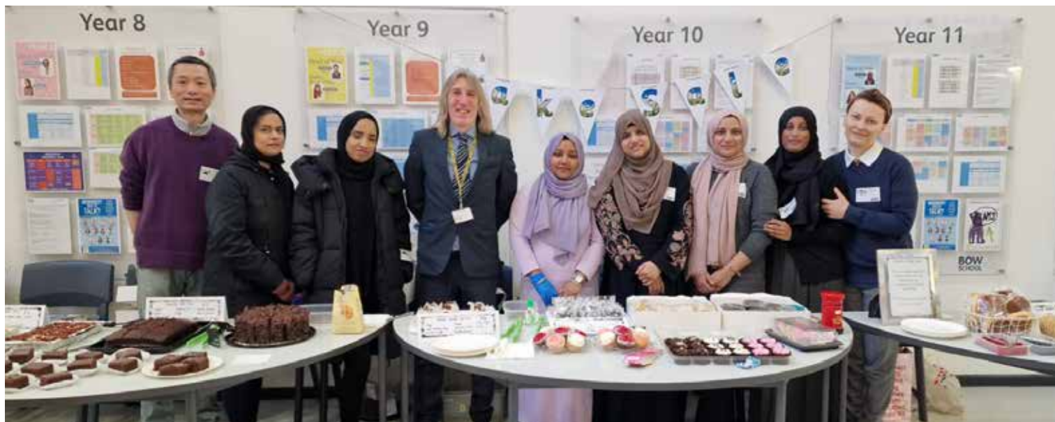
Bow School Parent Ambassadors Forum at the fundraising cake sale