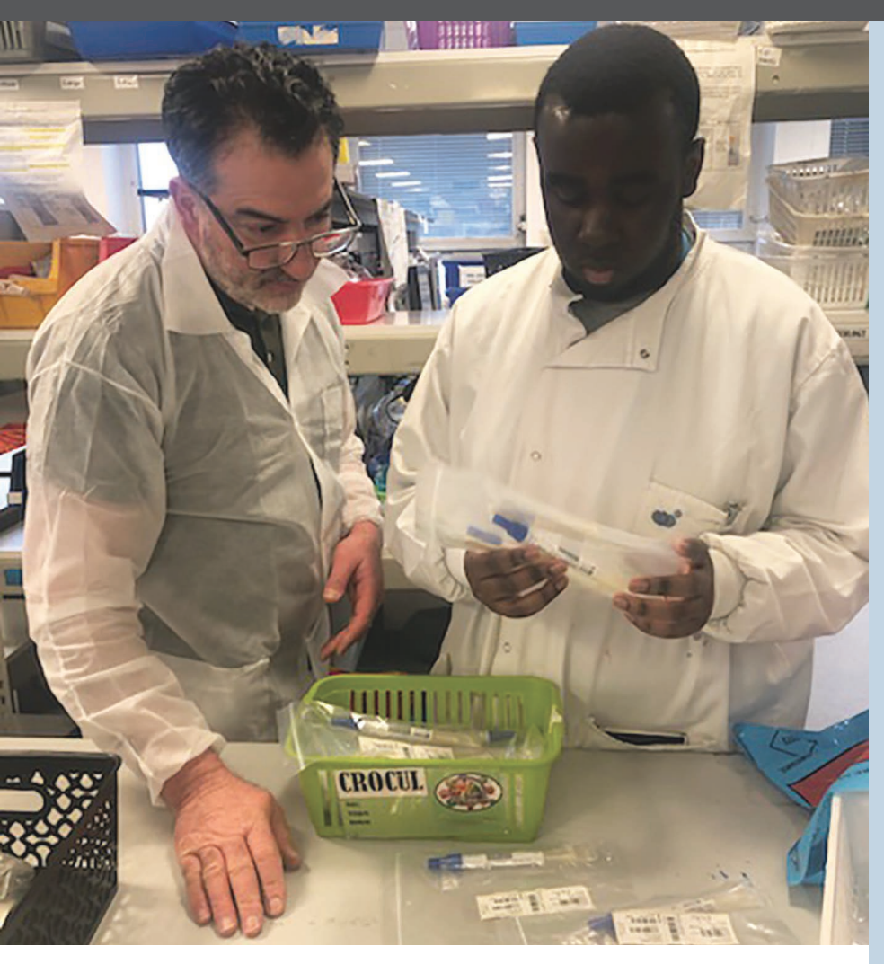
One of our interns at Imperial College Healthcare NHS Trust