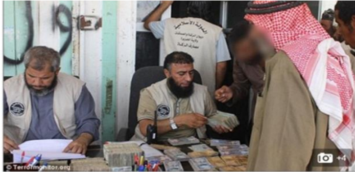
Charity? The propaganda shots show jihadis handing out cash to members of the public at a dole office

What's concerning is extremists often use images, videos and music that young people and children will know or like in their posts online and then link this to their information. This often presents changed information to present it as their own cause.