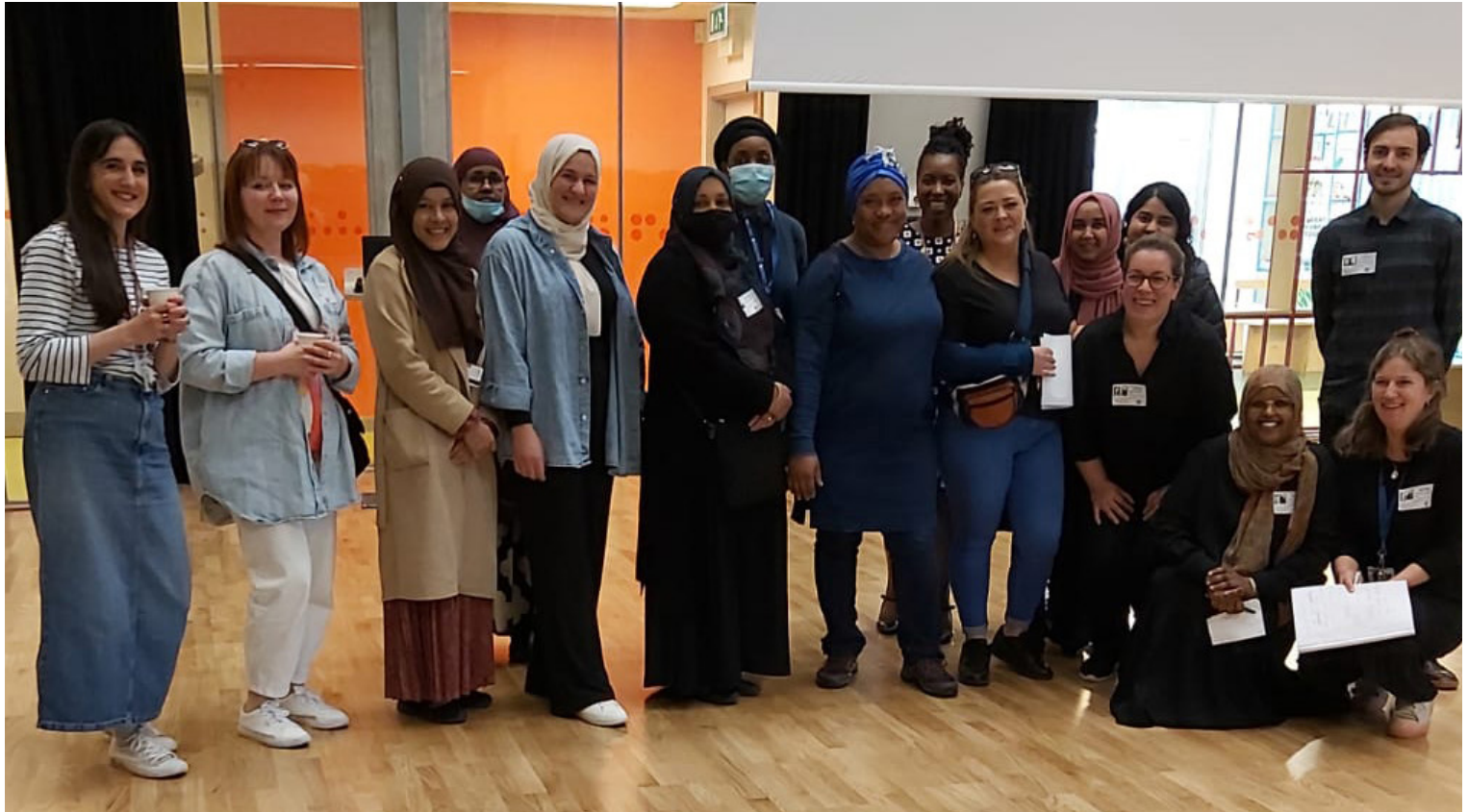
Langdon Park School parents, staff with Tower Hamlets SEND Parent and Young People Ambassadors, SENDIASS staff and other partners at the recent SEND Awareness Day